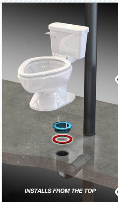
INSTALLS FROM THE TOP